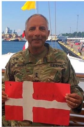
The Danish flag flies high!